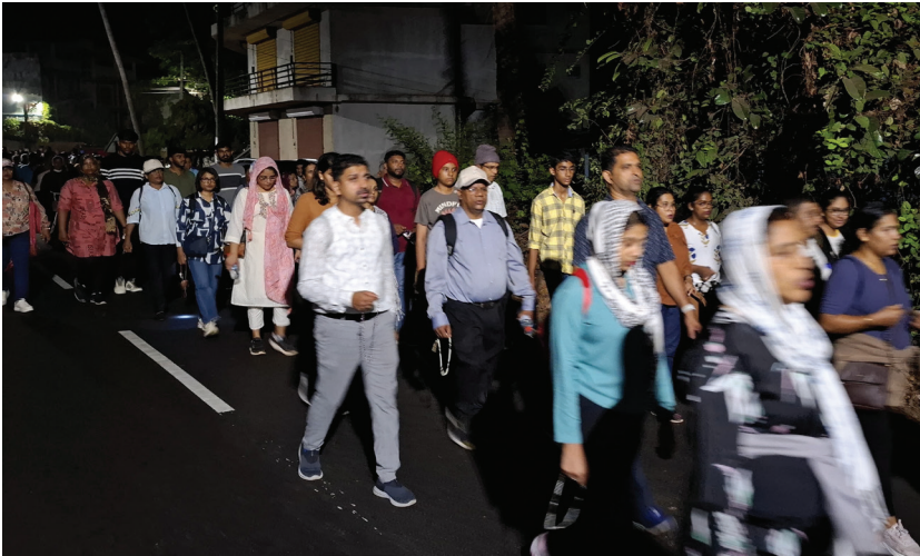
Pilgrims of Hope: Old Goa parishioners walk the Solemn Pilgrimage along with their Parish Priest

As we return to our daily lives, may this pilgrimage inspire us to continue our spiritual journey with renewed faith and a heart full of hope.