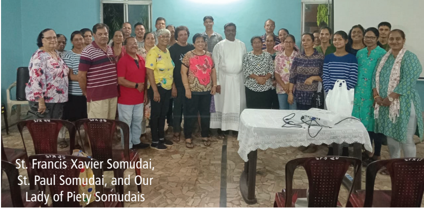
St. Francis Xavier Somudai, St. Paul Somudai, and Our Lady of Piety Somudais

Baptism and renewal: Passing through the Red Sea can be seen as a foreshadowing of baptism, where we leave behind our old