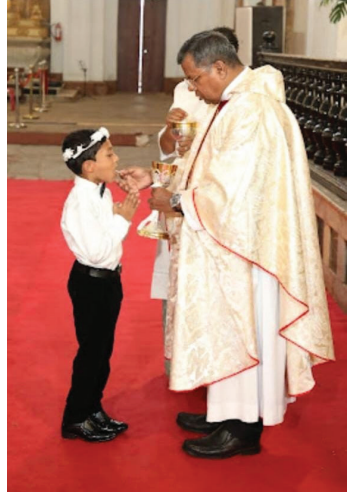
Eka Burgeak poilech pavtt Jezu ditana

Poilea Komuneanvacho somarombh mhol'lear nhoich fokot ek, punn don sacramentanchi toiari: Kumsaracho vo Sondhanacho sacrament toxench Komuneanvacho sacrament. Hea Sondhan sonvskaracho hetu bhurgeank kollun ieunk ho sonvskar Komunheavachea eka sumana adim, Fevrerachea 1tarker dovorlo. Sogllea bhurgeamnim hea sonvskarant bore bhaxen vantto gheun aplea patkanchem bhogsonnem maglem.